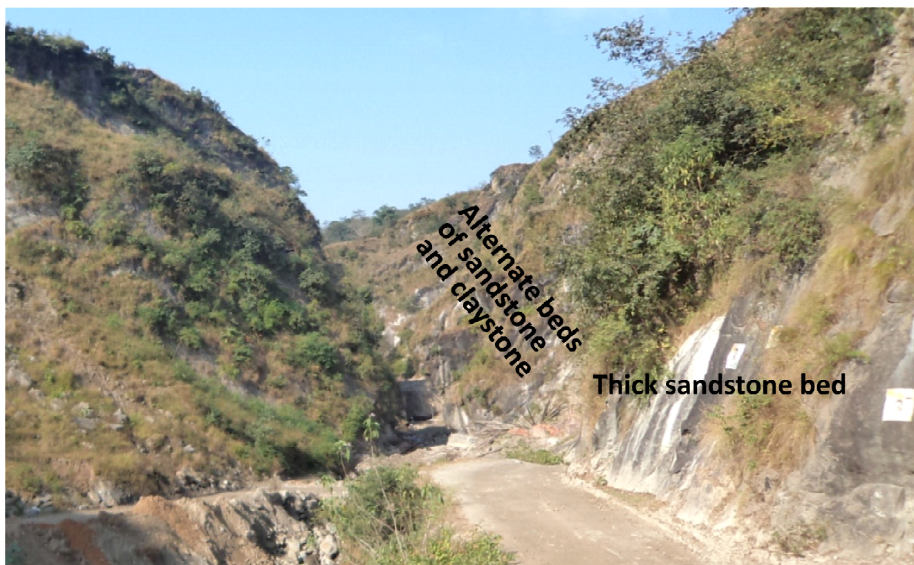
Figure 2. Middle Siwalik section on Sarkaghat-Dharampur Road from where fossil specimens were collected for present study.

extensive Neogene-Quaternary apron of freshwater sediments, which are exposed along the proximal margin of the Himalayan Foreland Basin, between Potwar Plateau in the west and Brahmaputra Valley in the east. Pilgrim (1913) was the first to provide three fold classifications of Siwalik as Lower, Middle and Upper Siwalik and suggested 7 faunal zones as Kamliial, Chinji, Nagri, Dhok Pathan, Tatrot, Pinjor and Boulder Conglomerate (Figure 2). It is interesting to note that these deposits represent one of the best continuous terrestrial Neogene fossil records, which are significant for understanding of the Eurasian terrestrial environments and palaeoclimates. The fossil locality Sarkaghat lies along the National Highway 70 in Mandi District, Himachal Pradesh (Figure 1). The fossil leaf bearing bed is a part of Middle Siwalik Sarkaghat anticline. It is characterized mainly by thick units of fine to coarse, dark grey indurate, multistoried sandstones with red, yellow and brown pedogenic mudstones (Figure 2).